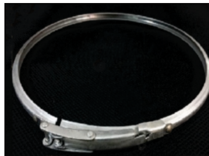
Diameter 419 mm (16.5 inches)