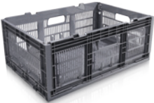
SmartCrate GP 6425 6425